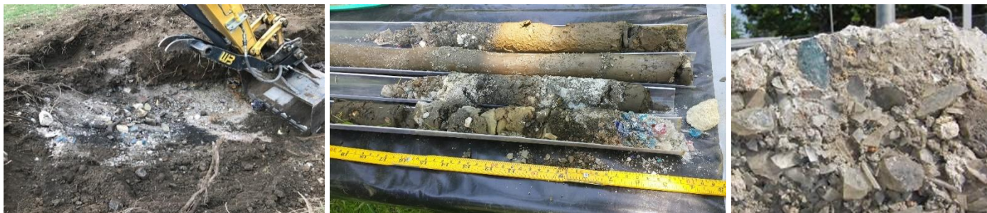
Examples of ash/brick/glass encountered in the Study Area

DEC recognizes that there are times when advance notice is not practical and a property owner is requested to notify DEC and Corning Incorporated for activities that had contact with a cover system that was installed on the property or with ash, brick, and glass materials as soon as the property owner can. DEC and/or Corning Incorporated will provide a written response on the next steps and any additional requirements pursuant to the Site Management Plan.